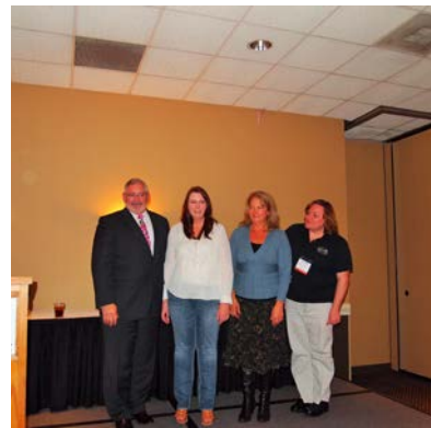
Incoming Board of Directors