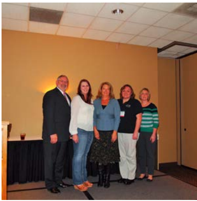
Incoming Board of Directors