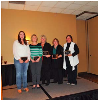
Outgoing Board of Directors